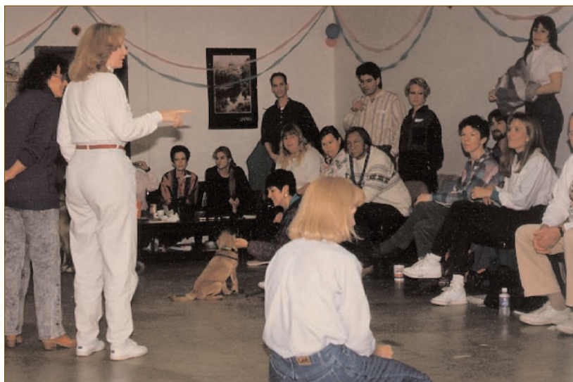
Not a bad start: eighteen people to meet one three-month-old puppy

Capitalize on the time your pup needs to be confined indoors by inviting people to your home. Your pup needs to socialize with at least a hundred different people before he is three months old. I know this may sound like a bit of an ordeal, but it is