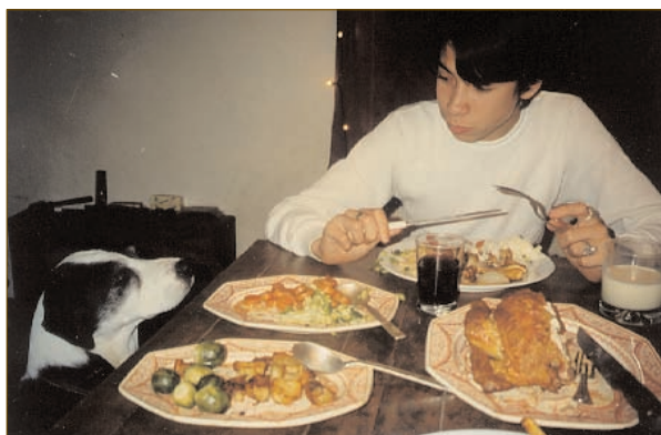
Teaching "Off" has many useful applications.

Basically, you have to teach your puppy that voluntarily relinquishing an object does not mean losing it for good. Your puppy should learn that giving up bones, toys, and tissues means receiving something better in return—praise and treats—and also later getting back the original object.