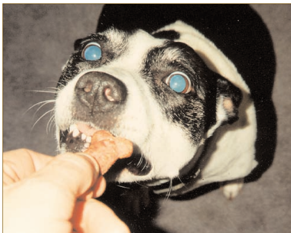
Green-eyed cookie monster

When played intelligently, physical games, such as play-fighting and tug-of-war, are effective bite inhibition and control exercises, and are wonderful for motivating adult dogs