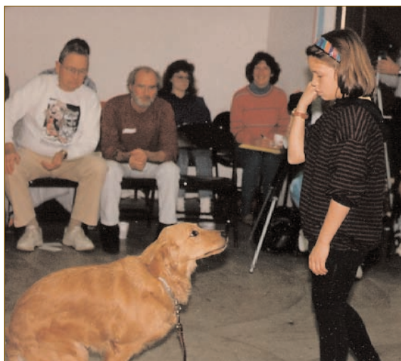
By coming when called and sitting on request, a puppy demonstrates willing compliance and shows respect to his trainer—a child.

Give children tasty treats such as freeze-dried liver as well as kibble to use as lures and rewards during handling and